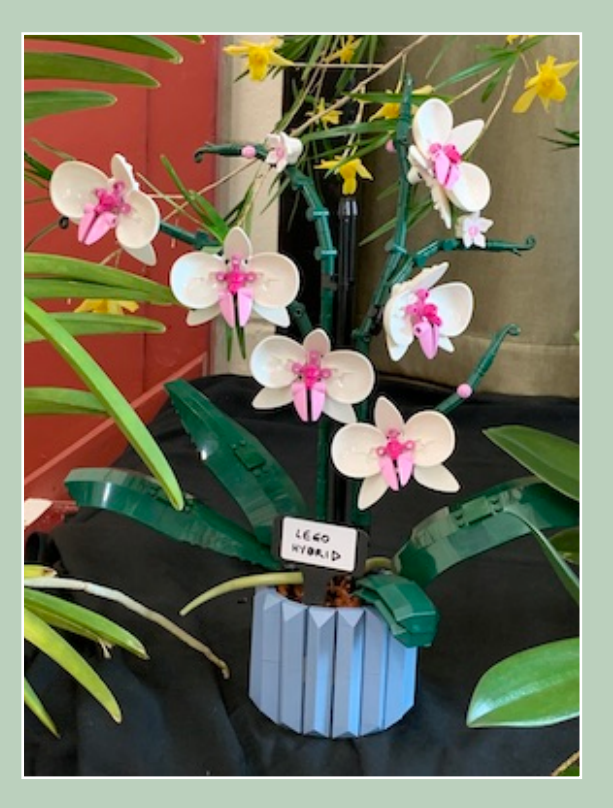
I still can't understand why this didn't get best in show?? Answers on a post card only please!