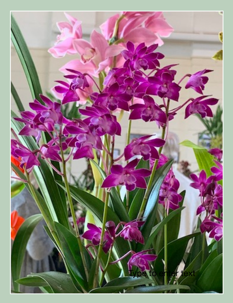
Dendrobium kingianum possibly