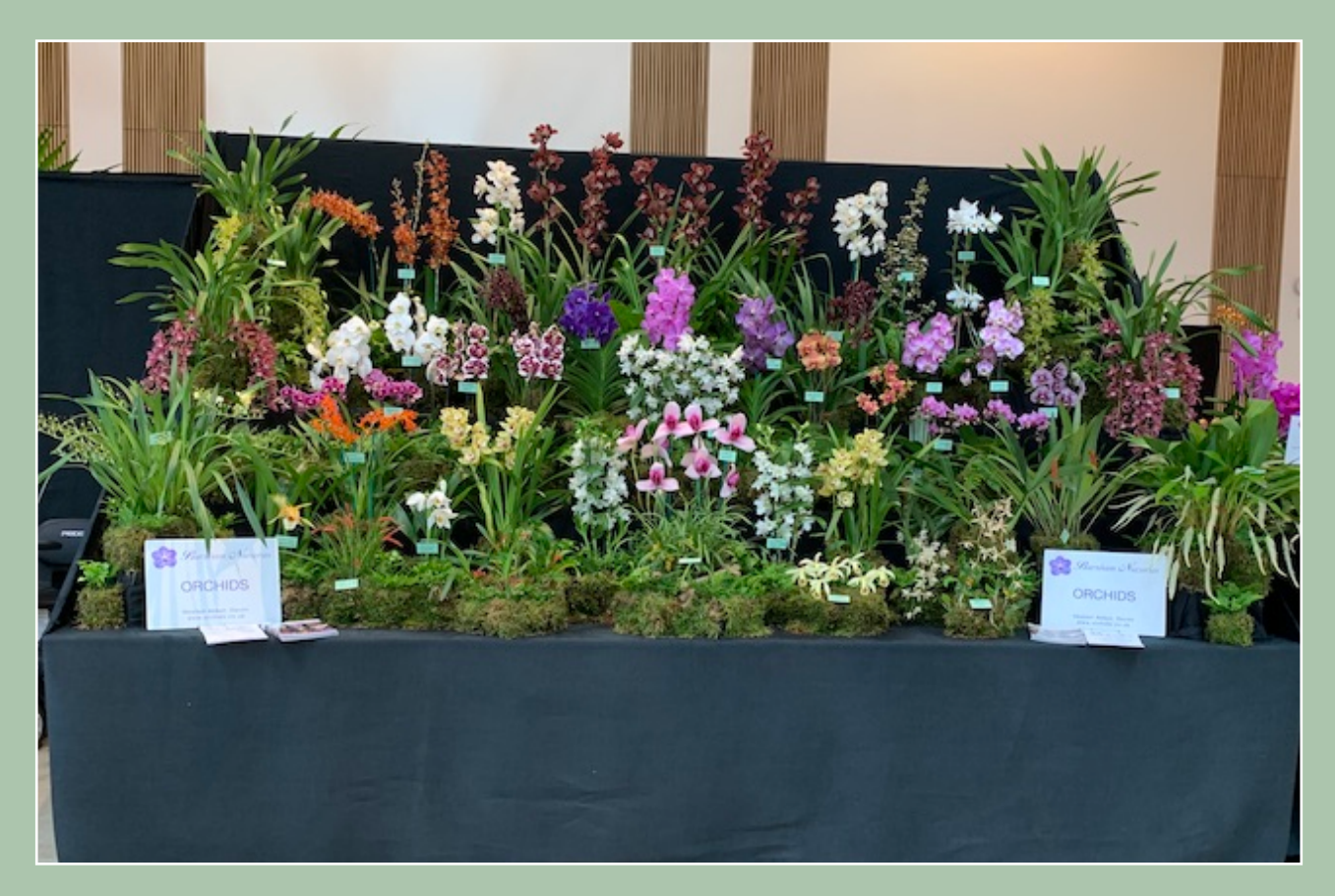
Burnham Nurseries Gold award