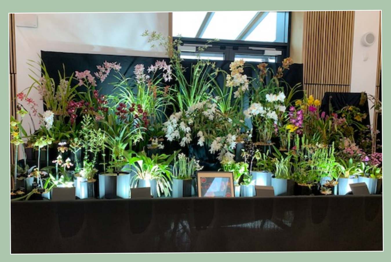
Bournemouth Orchid Society silver-gilt award