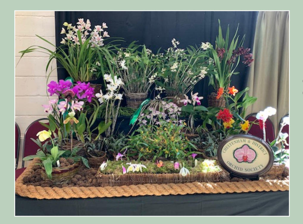
Cheltenham and District Orchid Society display

Well supported by neighbouring societies who all staged lovely displays with some well grown and unusual plants on display. A great friendly show where it was good to meet up with some orchid friends that we hadn't seen for a while. I mustn't forget Burnham Nurseries who represented the trade.